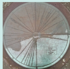
Toposcope at the Bay Hill

to the Chatham Islands, London, Toyko, Greymouth and Vancouver? Stand at the top of the Loop Rd to get your bearings with the distance dial Toposcope. Look to the west, can you see Timaru's tallest tree, the 34m high Wellingtonia Gigantica?